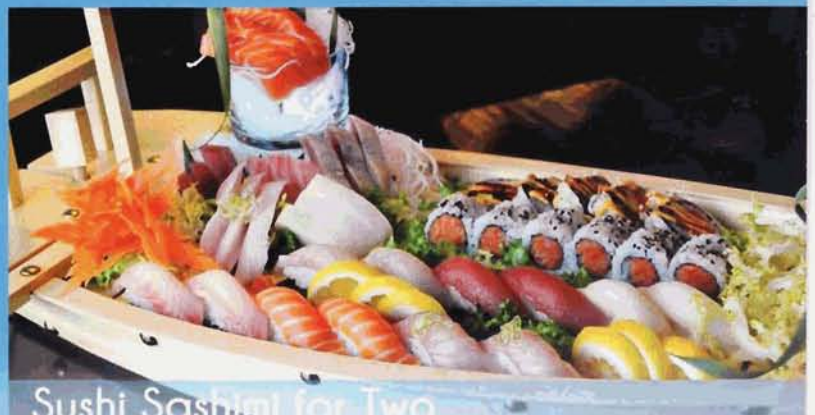
Sushi Sashimi to Two