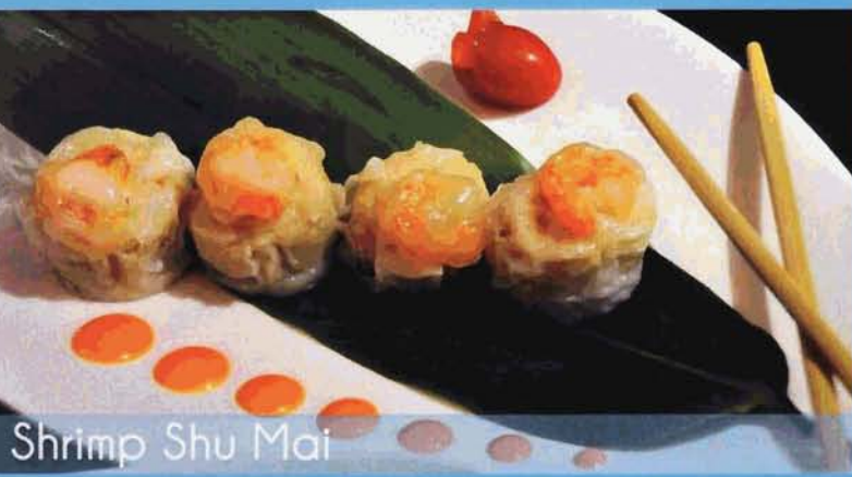
Shrimp Shu Mai