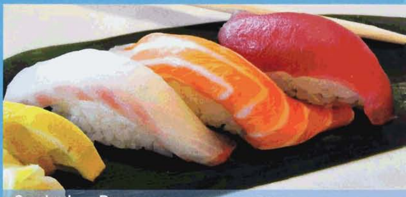
Sushi by Pieces