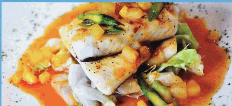
Hawaiian Style Red Snapper