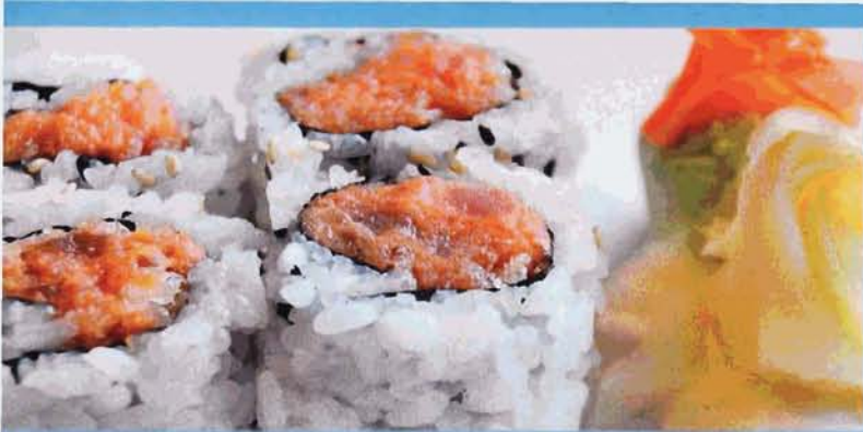
Spicy Tuna Roll